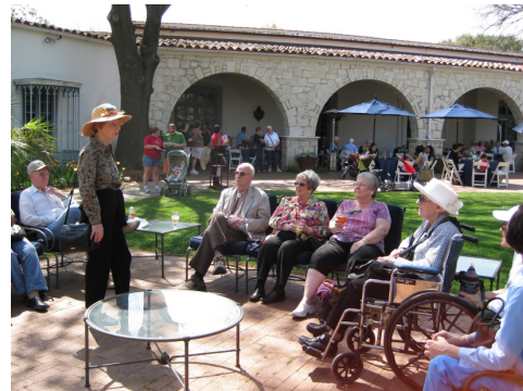
Waiting for lunch.