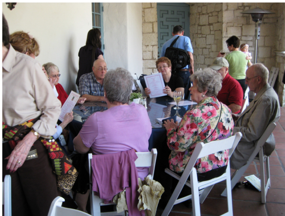
Food at last!