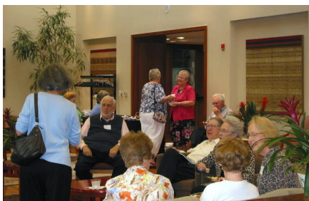
A time for visiting