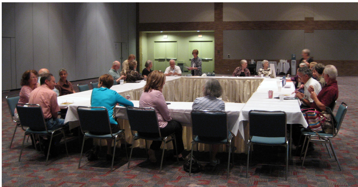
September 23 rd Meeting at the Plano Centre