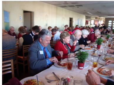
A really great crowd