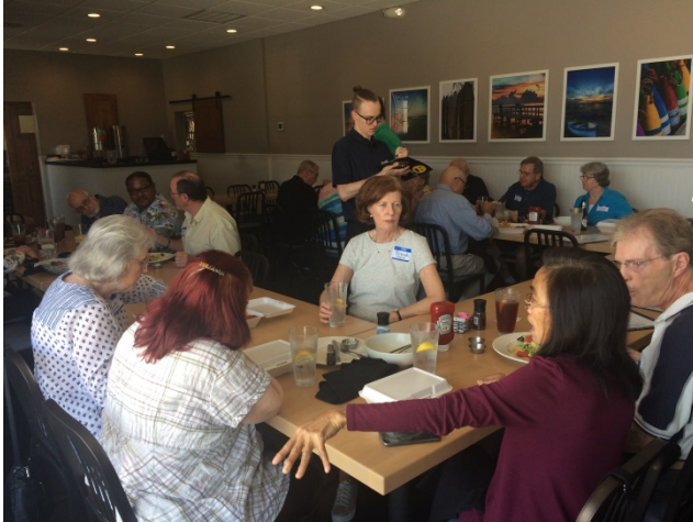
FML June 4, 2018 at Chien Garden