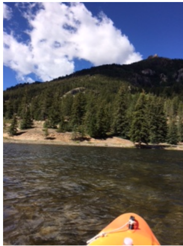
View from Judy's kayak