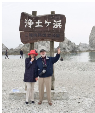
Kodogahama Beach, Miyake Rad Crane Park