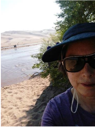
Great Sand Dunes National Park in Colorado