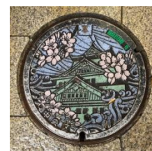
Okala Manhole Cover