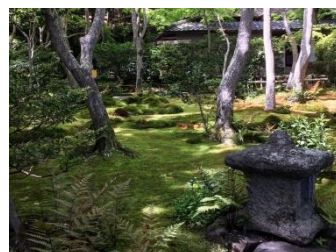
Kyoto Moss Garden