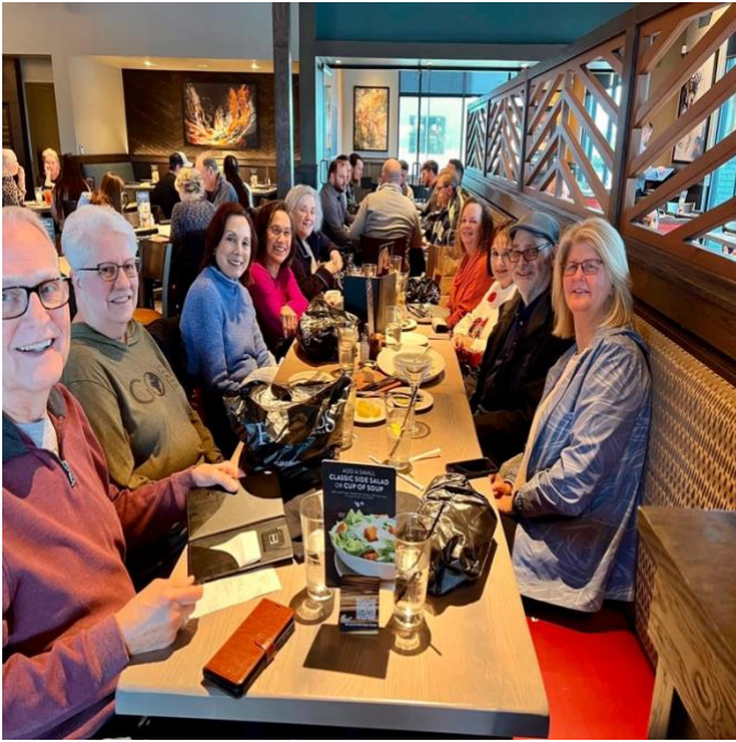
FML - FIREBIRD'S 1/8 (10 ATTENDED)