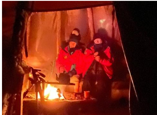
Shivering in a wigwam waiting for aurora that never arrived.