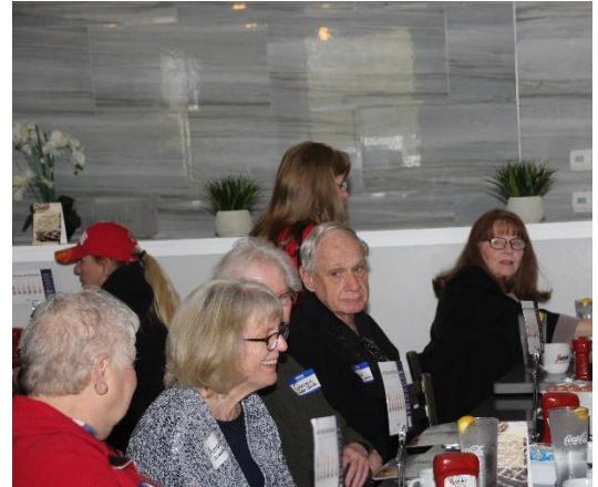
May 6, 2019 at the Fifth in Richardson